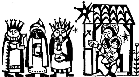
The Three Kings

St. Hilary was born in the city of Poitiers (France) in 300 a.d. Because of his outstanding holiness and leadership he was chosen to be a bishop at a time when the Church was engaged in a great struggle against a heresy known as Arianism – which in effect denied the divine nature of Jesus. Hilary was a staunch defender of orthodoxy and suffered much for his fidelity to the truth of the gospel.